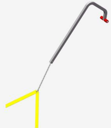
Roof Hook with Steel Chain