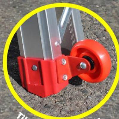
Tilt and Glide Wheels