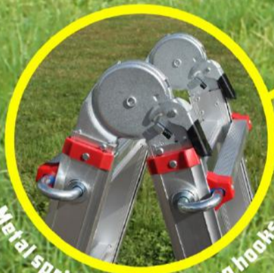
Metal spring loaded locking hooks