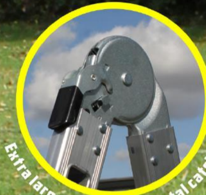
Extra large hinges with metal catch