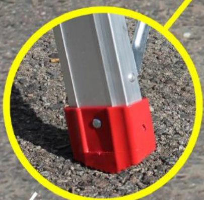
Large non-slip feet