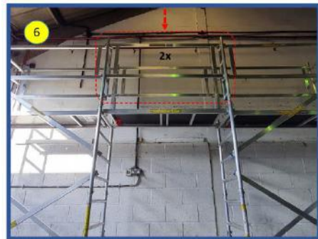
Insert guard rails above linked platform.