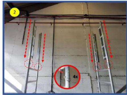
Assemble towers up to the top frames and insert walk through frames as shown. Secure with snap pins.