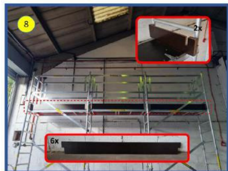
Insert toeboard as shown if required.