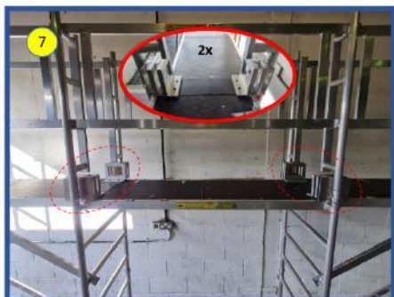
Insert infill decks between platforms.