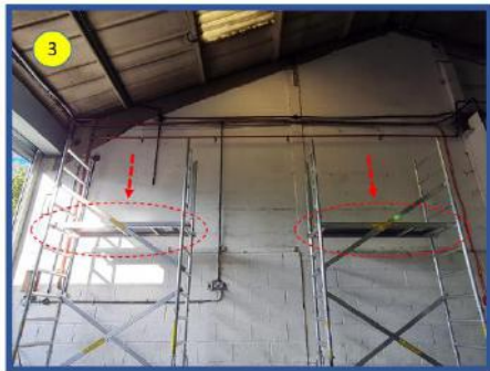
Complete tower assembly by adding diagonal braces, top platform...