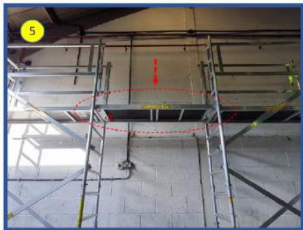
Insert linking platform. Recommend 2 people.