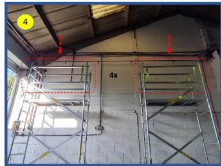
...and guard rails.